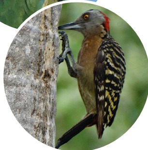
Two endemic species found on Hispaniola.