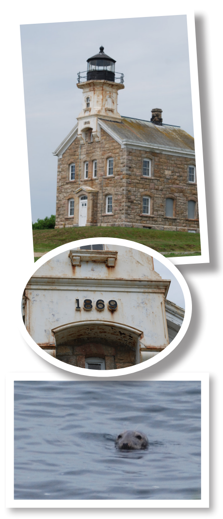
The lighthouse which can be seen from Orient Point and one of the seals that haul out on the Island.

separated from it by Plum Gut, lies Plum Island, an 822-acre pork-chop shaped island that is owned by you and me (being the federal taxpayers that we are).