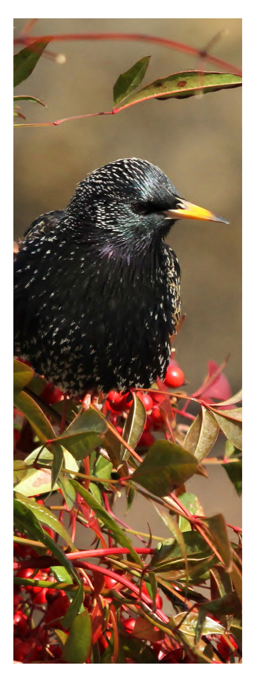
European Starling