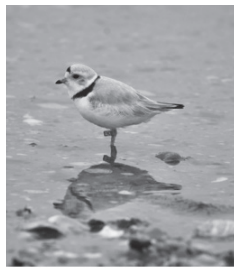
A tagged bird from one of the studies will help researchers learn about site fidelity.

Tt is mid-July along the ocean beaches of Rhode Island and Massachusetts ■ and the Piping Plover are getting restless. After spending the late spring and early summer nesting and raising their young they anxiously await favorable wind conditions to begin their journey to overwintering locations. This journey has been taken by generations of Piping Plovers, yet it is not completely understood. During 2015 through 2017 researchers from Massachusetts, Rhode Island, Canada and the US Fish and Wildlife Service fitted Piping Plover with VHF radio transmitters. Little is known about exactly when, under what conditions, and what routes these shorebirds take to reach their overwintering areas along the Southeast Atlantic seashore into the eastern central Caribbean Islands.