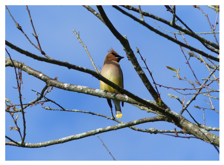
Cedar Waxwing, a beautiful spring bird.

The park is located at 5330 Sound Ave, Riverhead, NY 11901. It is east of Church Lane.