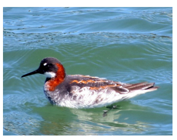
Red-necked Phalarope Below, Northern Waterthrush Silhouette, Rudy Turnstone