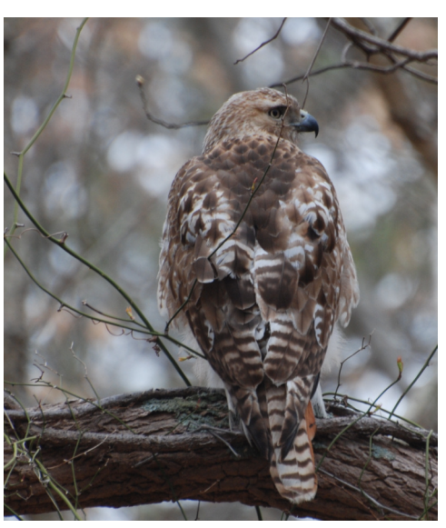
A rather blase Red-tail Hawk perched in the woods at Terrell River County Park. Below, two Glossy Ibis on the flats of the Terrell River.