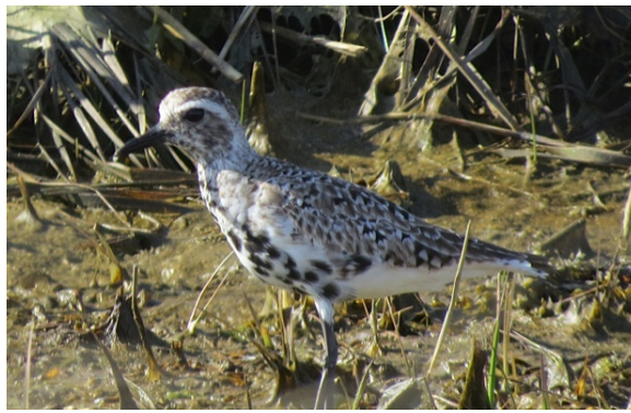
Black-bellied Plover in transitional plumage