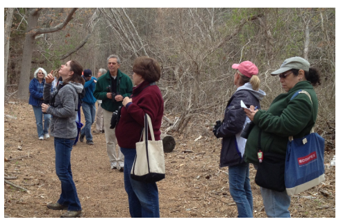
Terrell River, May 5.