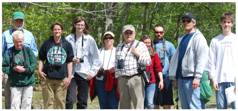
Wertheim National Refuge, May 18.

There were six nature walks in May. Groups went to Hallock State Park, Terrell River County Park, Wertheim National Wildlife Refuge (twice), Quogue Wildlife Refuge and the William Floyd Estate. I hope you have time to join! Photo albums are usually posted on Facebook after the walk if you would like to see more photos.