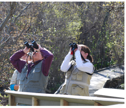
At Quogue Wildlife Refuge, May 10.