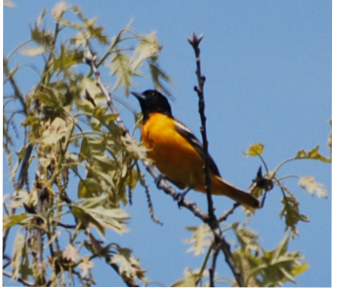
Baltimore Orioles were spotted on almost all of the walks.