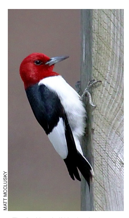
This Red-headed Woodpecker was a one-day wonder captured by Matt McClusky at the West End of Jones Beach.