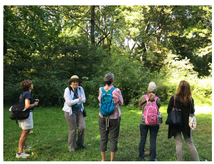
Waiting for the Cuckoo to appear in Central Park