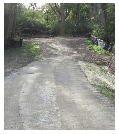
Raised road with aggregate directly on top of the wetland area

There is so little open space left on Long Island, and the few areas we fought so hard to save and protect are being altered, manipulated and destroyed without regard for the whole environment. At one of