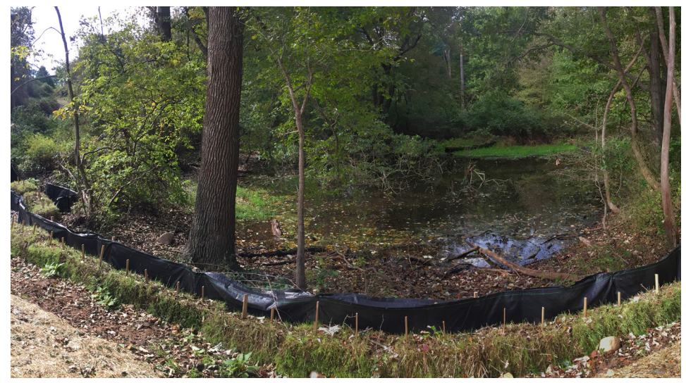
Heavy rains breached the fence depositing silt in pond.

and so many of them had nothing at all to do with the water flow onto peoples beaches during severe storms. These were the areas where the rare Featherfoil plant grew, and rare old growth swamp white oak forests exist, and frogs and salamanders breed. Certain environmentalists tried in vain to get some of these wetlands spared from bulldozing, rechanneling and total destruction. Most of these wetlands are vernal ponds – they dry up in the summer. Because of all the bulldozing, reconstruction, impoundments, megaditches and what should have been illegal work... pristine freshwater ponds have been negatively impacted, compromised and silted in. What that means is frogs, salamanders and Featherfoil can't grow in them anymore. Old dirt trails have been widened into boulevards in several areas plus they have been raised, they are now 5 to 8 feet higher than normal grade.