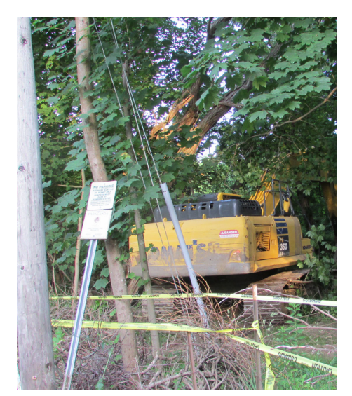
Giant tractor wider than trails