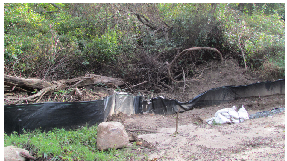
Breached silt fence, but project deemed complete