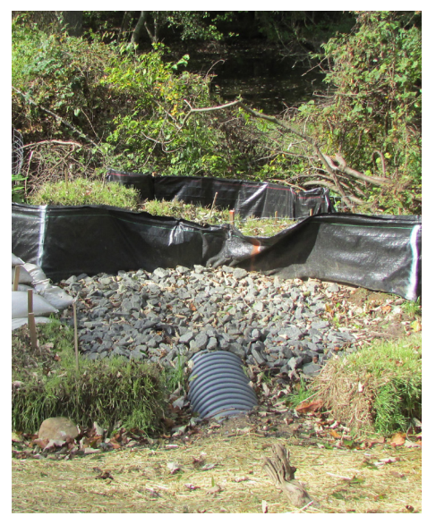
Wetland being comprised – Featherfoil pond now silted as water went though and underneath fencing

the half dozen meetings held about the destruction in the park the engineering expert with the County Public Works Department admitted "we don't know what this will do to the hydrology of the area." Nor it seems do they care.