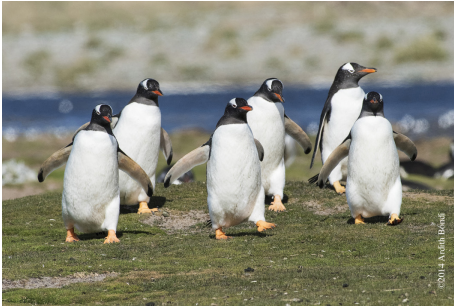
Gentoo Penguins returning from the ocean